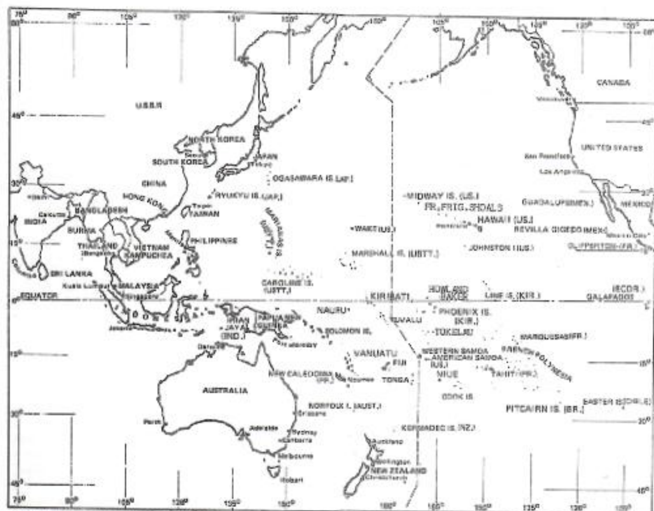
Figure 1. Map of the Central Pacific Ocean.

mochely imbricata , and the leatherback, Dermochelys coriacea . The olive ridley, Lepidochelys olivacea , and the loggerhead, Caretta caretta , have been recorded, but only as rare visitors.