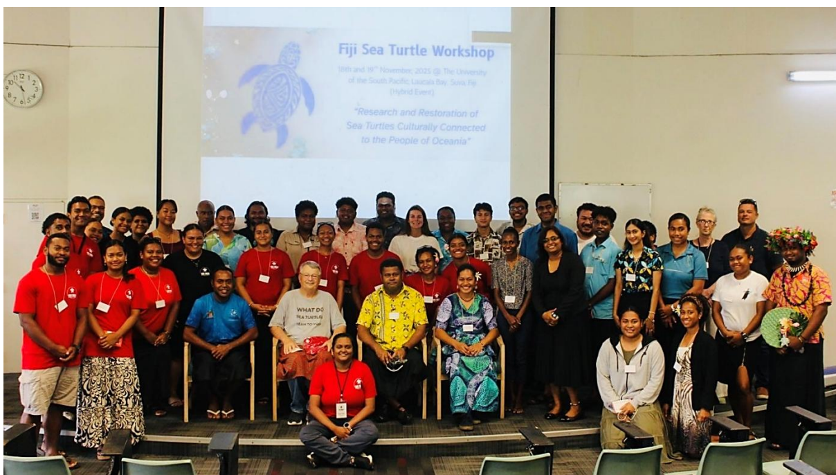
Day 2 with workshop participants