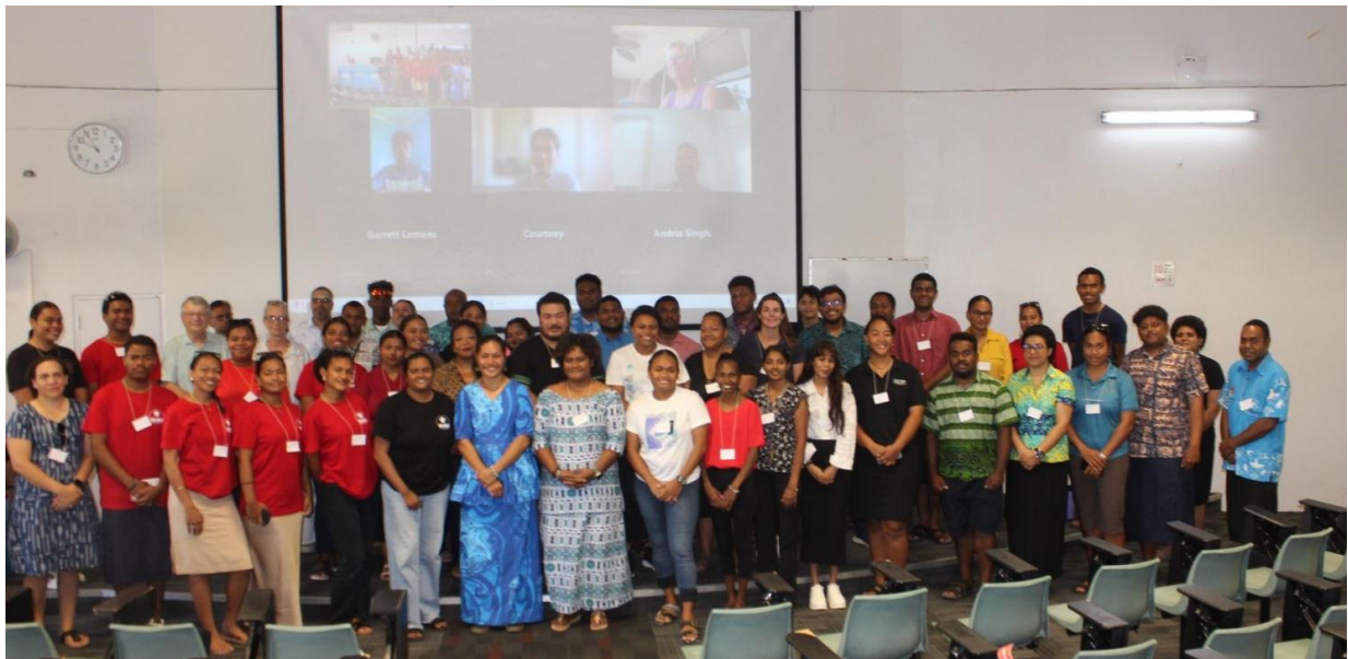
Day 1 with workshop participants