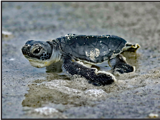
Fig. 4. A 2021 Chelonia mydas hatchling from Sanibel Island that completed incubation within the island's biogenic sand and successfully traversed the beach to enter the Gulf of Mexico.